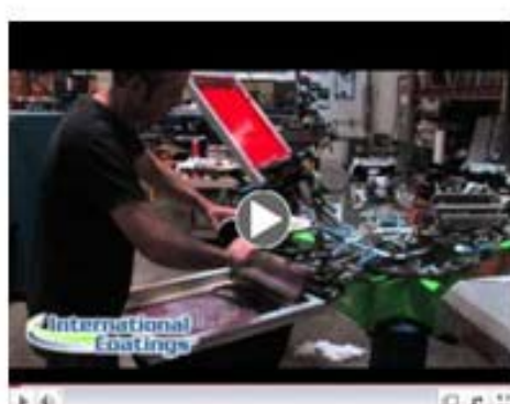
BlowOut Black Technique

We have just added the BlowOut Black Technique video which showcases our 3810 BlowOut Base. Check out our latest product and how-to videos on IC TV .